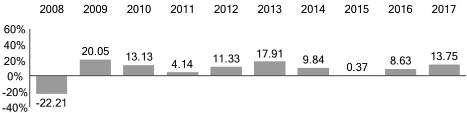
Annual Total Returns — Vanguard Balanced Index Fund Investor Shares

During the periods shown in the bar chart, the highest return for a calendar quarter was 11.26% (quarter ended September 30, 2009), and the lowest return for a quarter was -12.54% (quarter ended December 31, 2008).